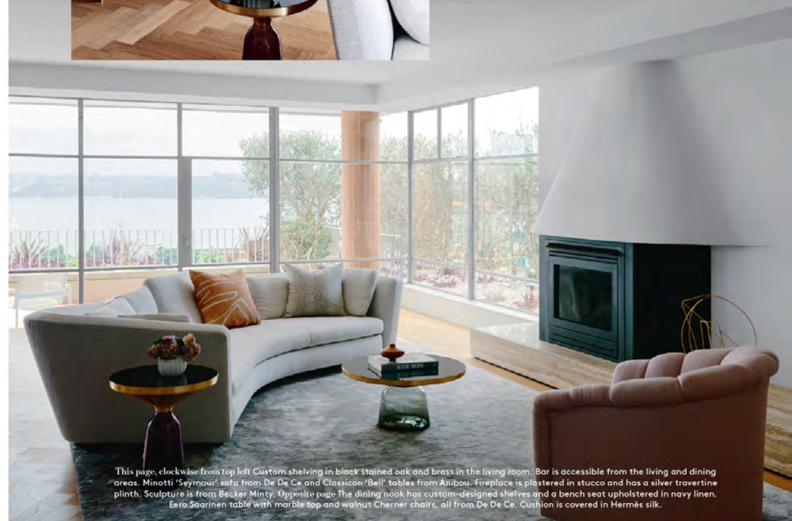
This page, clockwise from top left: Custom shelving in black stained oak and brass in the living room. Bar is accessible from the living and dining areas. Minotti 'Seymour' sofa from De De Ce and Classico 'Bell' tables from Anibou. Fireplace is plastered in stucco and has a silver travertine plinth. Sculpture is from Becker Minty. Opposite page: The dining nook has custom-designed shelves and a bench seat upholstered in navy linen. Eero Saarinen table with marble top and walnut Cherner chairs, all from De De Ce. Cushion is covered in Hermès silk.