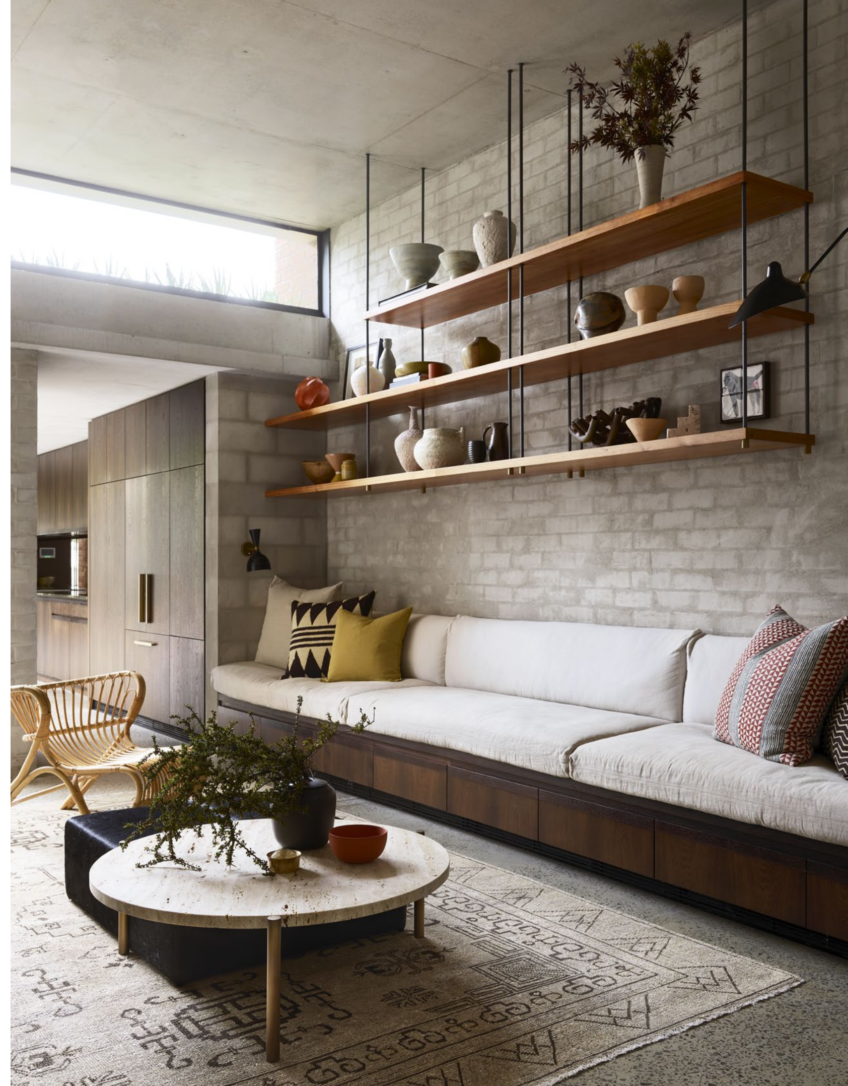
Living area A ‘Tivoli’ travertine-topped coffee table by Ten10 sits on a vintage rug. The sofa, upholstered in Belgian linen, was designed by Arent & Pyke, while the shelves above are a bespoke design in Tasmanian blackwood, steel and brass by architects Welsh + Major Stockist details on p194 ▶