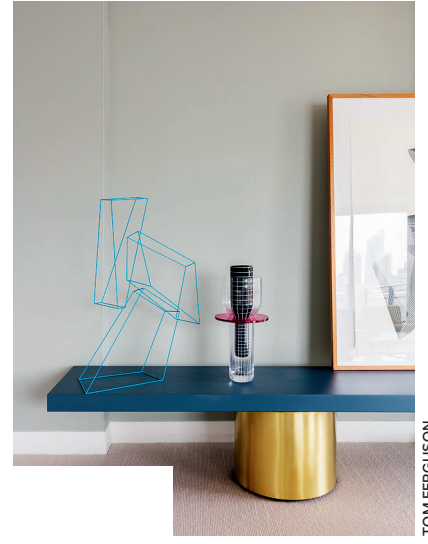
An extensive overhaul of this Pyrmont apartment by Arent & Pyke took 12 months.

The client, a young couple with a love of the arts and entertaining, bought the three-bedroom flat for its bustling inner-city location in Pyrmont, just two kilometres from Sydney's central business district.