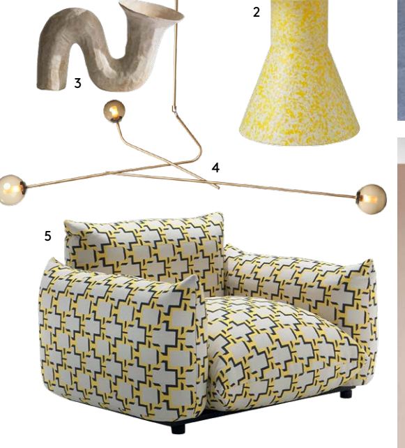
Figure 1, 2019 artwork by Gregory Hodge, $27,000, from Sullivan+Strumpf. 2 Normann Copenhagen 'Bit' cone stool, $464, from Farfetch. 'Trumpet' glazed vase by Kirsten Perry, $3000, from Saint Cloche. 4 De La Espada 'Lattice' pendant light by Neri & Hu, from $13,895, from Spence & Lyda. 5 Arflex 'Marenco' outdoor armchair, from $9740, from Space.